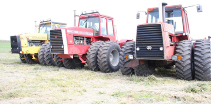
Mike Whalen's three four wheel drivers.