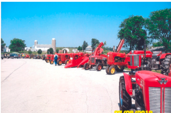
Misc. Tractors and Equipment