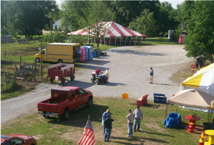
View of the vendor and meal tents.