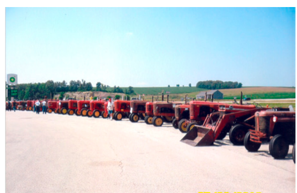
Misc. Tractors and Equipment