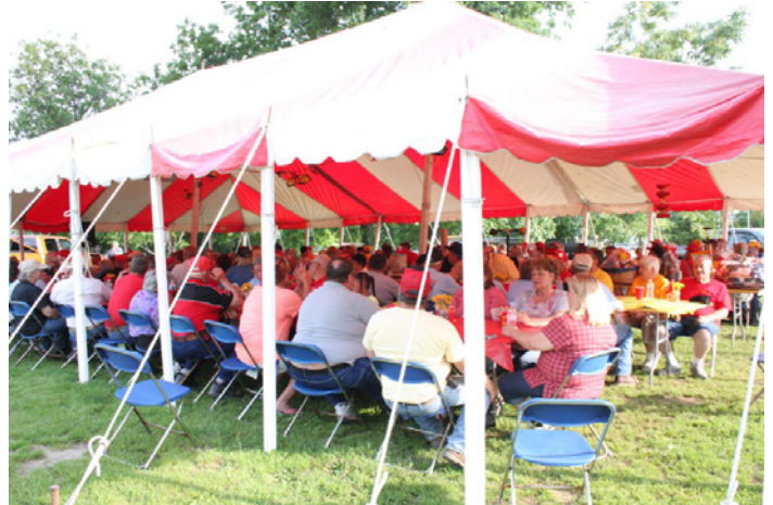
Massey guests eating a meal under the tent.