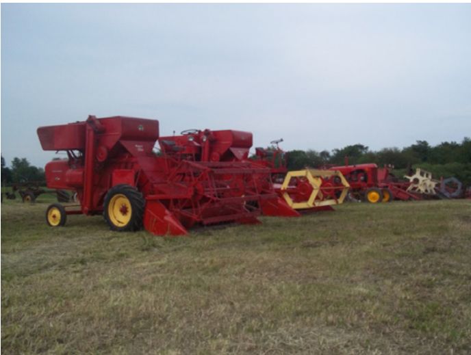
Display of #35 combines.