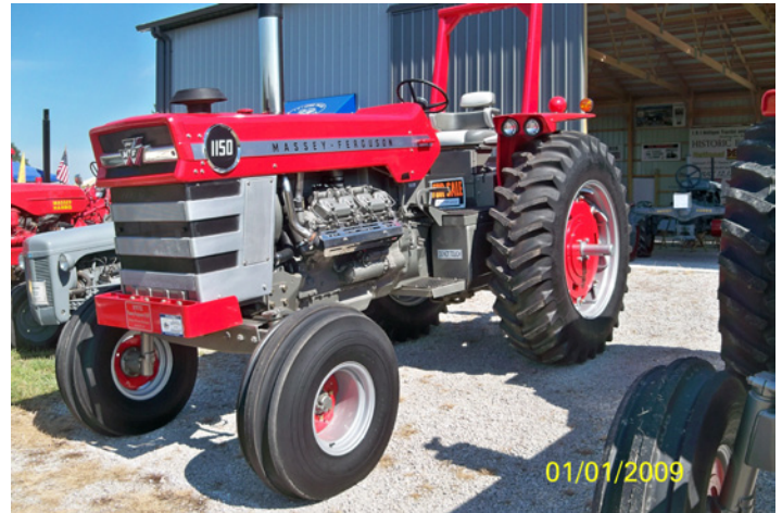
Very sharp MF 1155