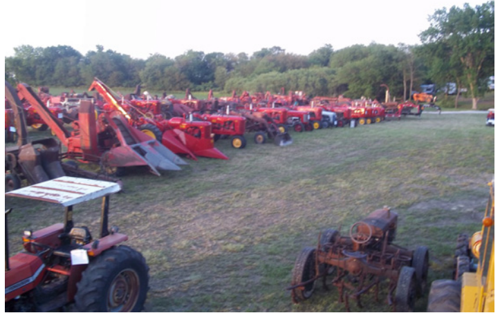
View from the hillside.