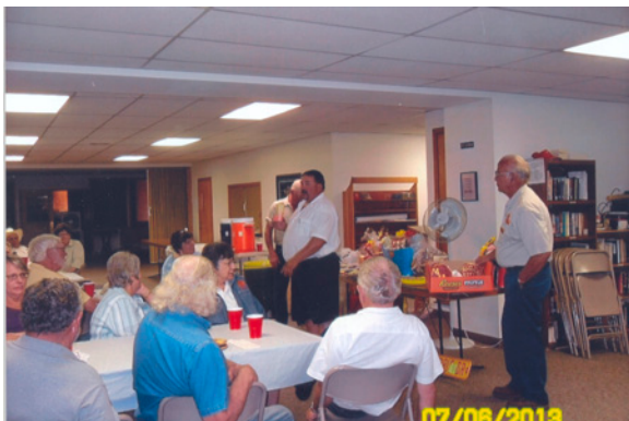
Saturday Night Banquet and Auction