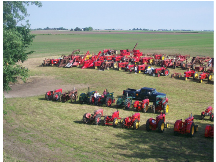
View of the field.