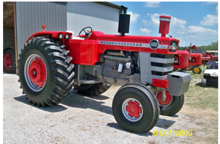
Have you ever seen an MF 1100 Western?