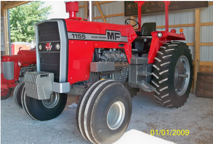
Very sharp MF 1155