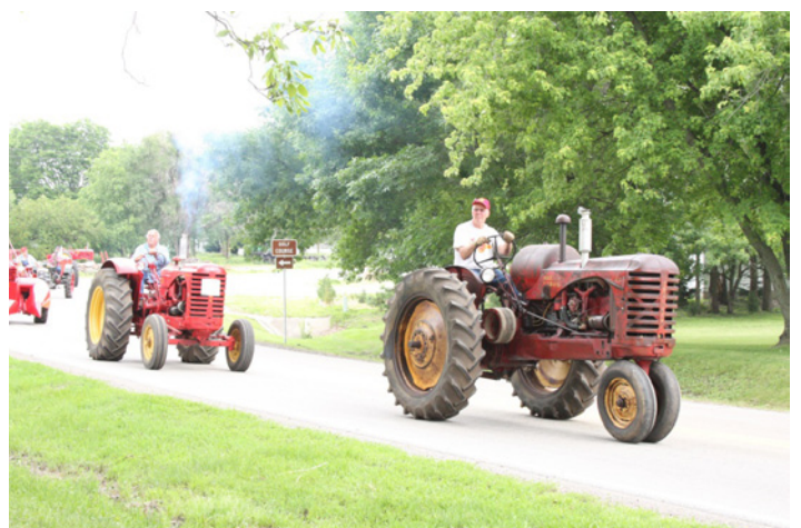
The parade on US251 in Kappa.